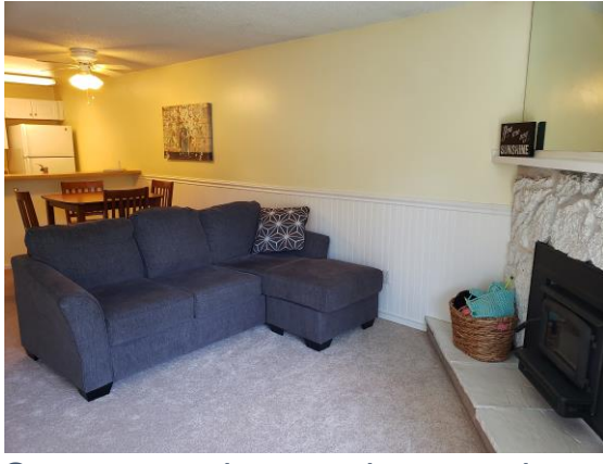
Super-cute, immaculate condo at 6007 E. 6<sup>th</sup> Ave., Spokane Valley,